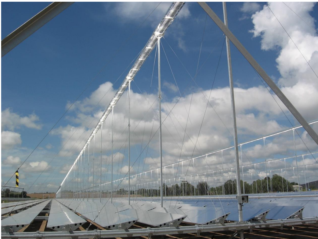
Figure 2 Existing solar array area