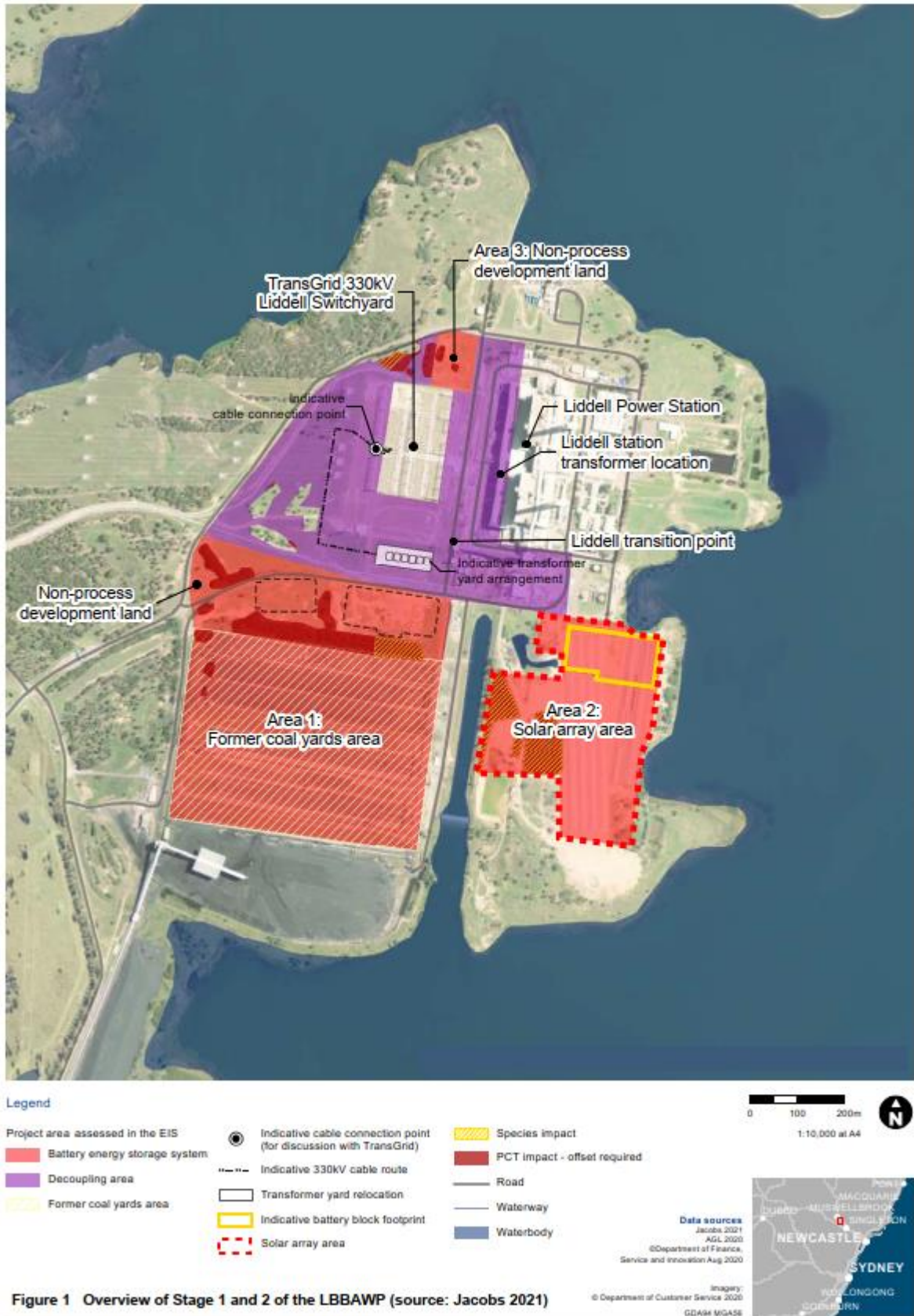
Figure 1 Overview of Stage 1 and 2 of the LBBAWP