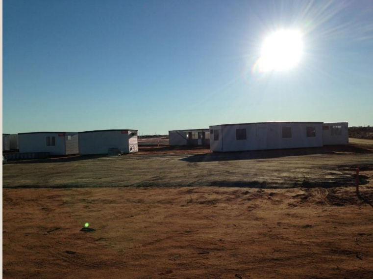
Temporary construction facilities