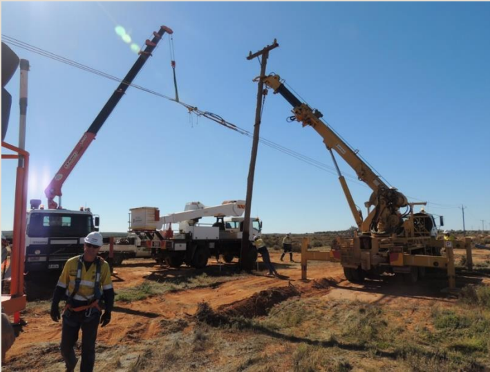
22kV Transmission line relocation UGOH pole replacement