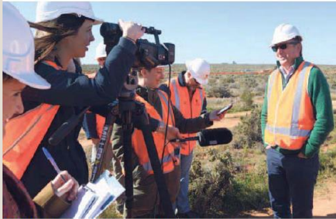
Minister for Natural Resources, Lands and Water Kevin Humphries at the Broken Hill Solar Plant site yesterday.