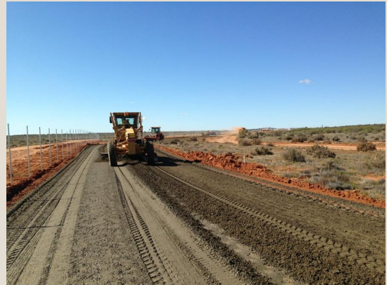
Scraper on access road