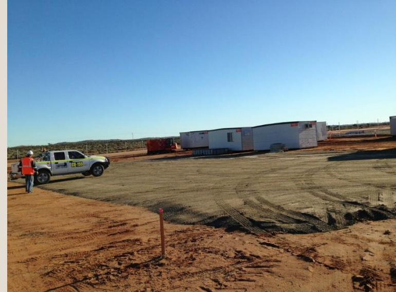
Temporary construction facilities