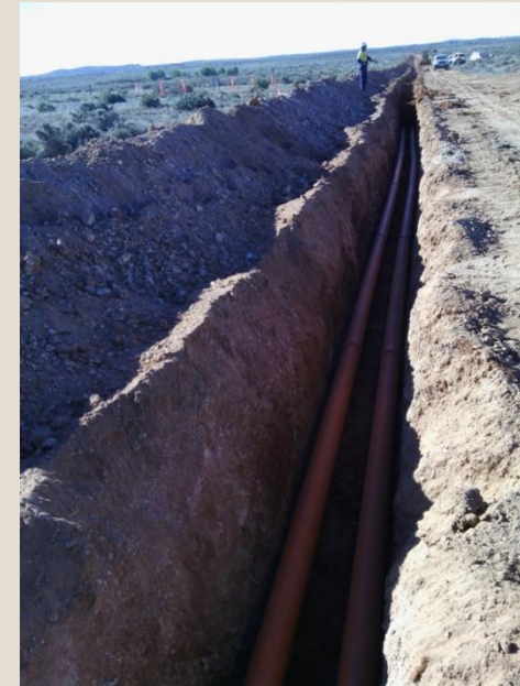
22kV Transmission line underground trench with conduit