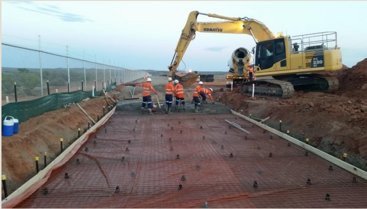
Concrete crossing reinforcement