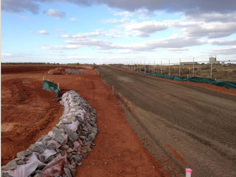
Site access roads and drainage