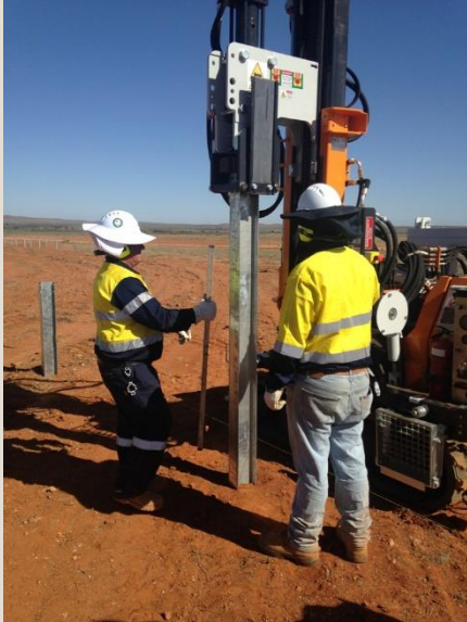
Post trial installation