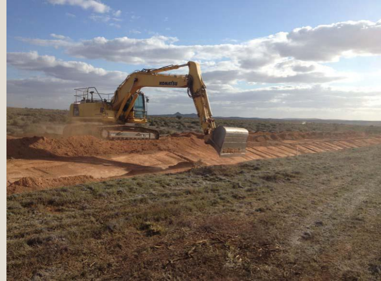
Construction of drainage channel