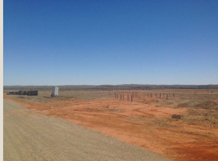
Installed trial posts