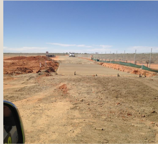
Site access roads concrete crossing