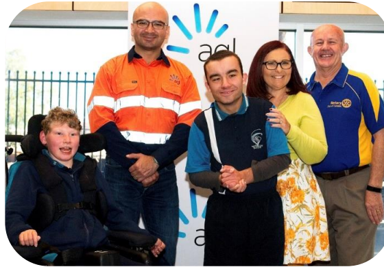
AGL and Rotary Club of Camden, funding the purchase of teaching aids for students with disabilities at Yandelora School.