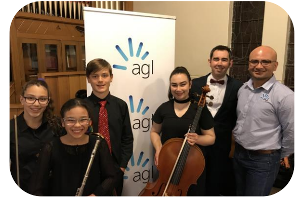
AGL and the Fisher's Ghost Youth Orchestra, funding costs associated with managing the young musicians' performances.