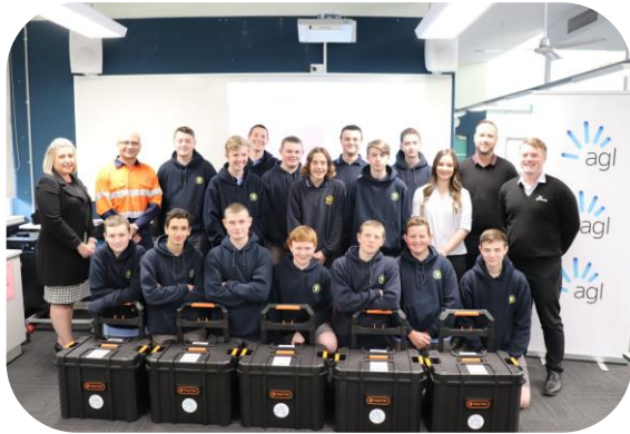
AGL and My Gateway distributing toolboxes to students of Camden High School.