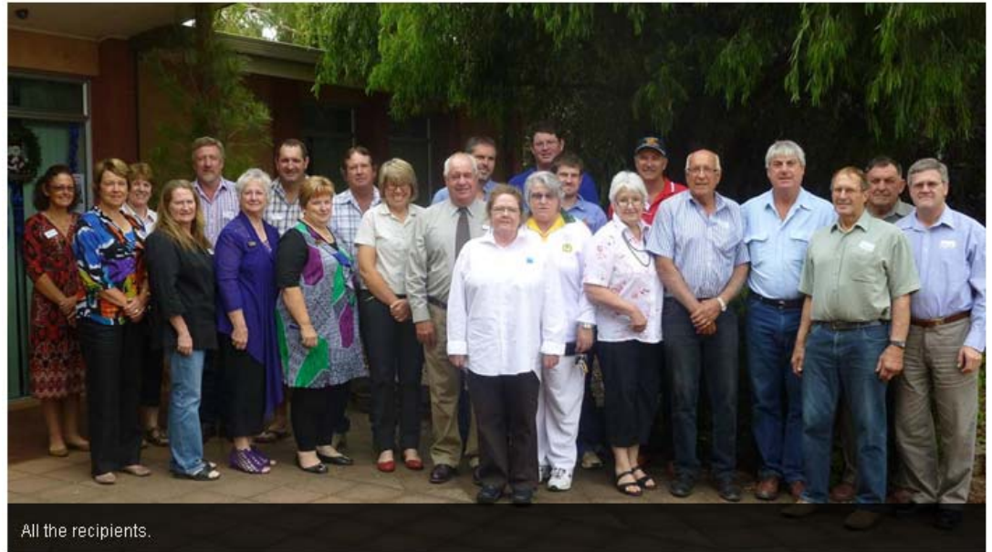
Recipients of 2012 Hallett Community Fund