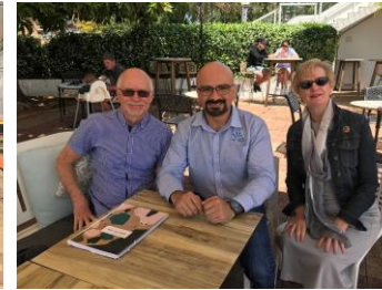
Tomaree Museum Association