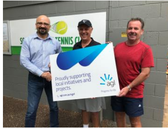
Soldiers Point Tennis Club