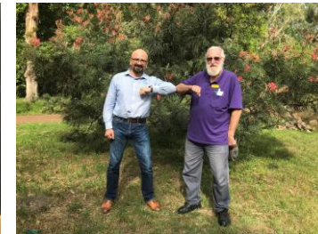
Hunter Region Botanic Gardens