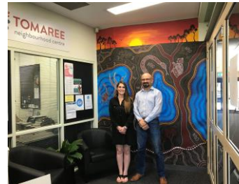
Tomaree Neighbourhood Centre