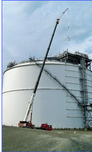
4 yearly testing and calibration of tank top safety relief valves