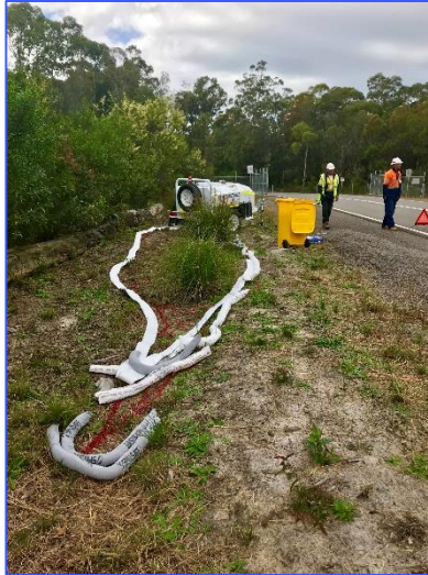
Loss of containment drill undertaken