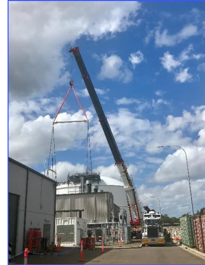
Installation of Variable Speed Drive (VSD) infrastructure for main refrigeration compressor