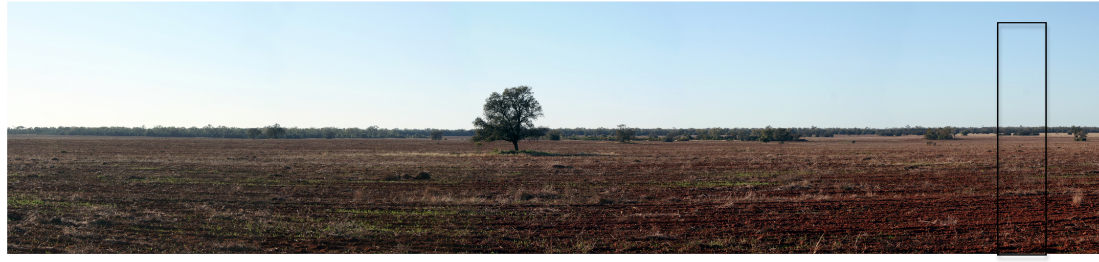
With proposed transmission line (above) and enlarged view showing one pole (right)