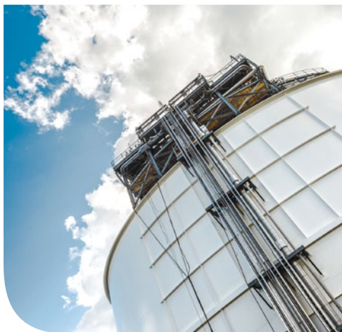
The recently opened Newcastle Gas Storage Facility

The Upstream Gas review has resulted in a pre-tax loss of $603 million ($435 million after tax) which was included as a Significant Item in the FY15 results.